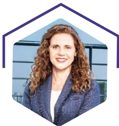
Chief Executive Officer