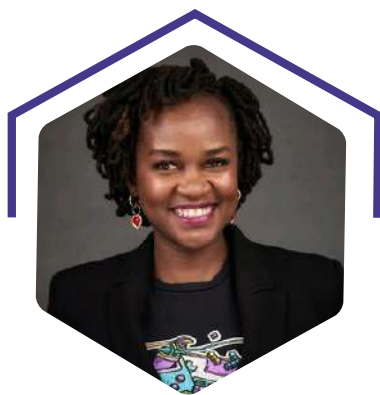
Co-Founder & Partner