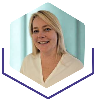
Chief Investment Officer