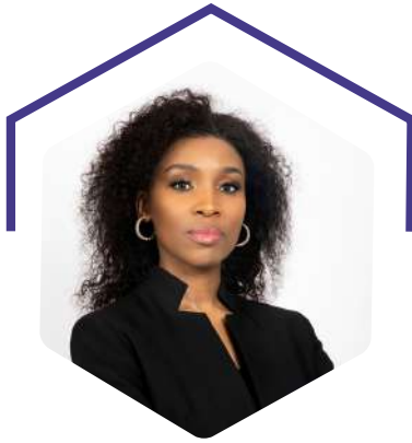
Founder & Managing Partner