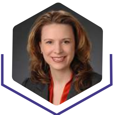
Co-Founder & Partner