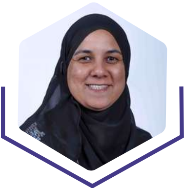
Chief Financial Officer