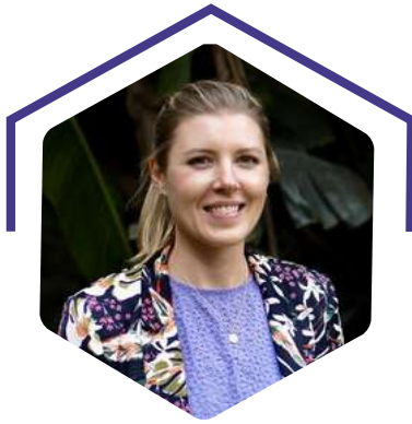
Co-Founder and CEO