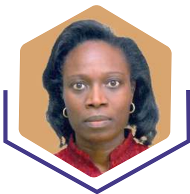
Partner and COO