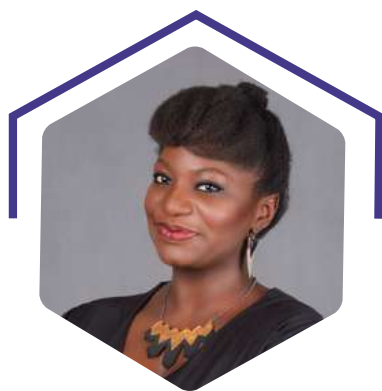
Founder and Executive Chair