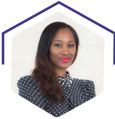
Founder and Managing Partner