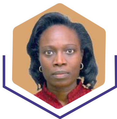
Partner and COO