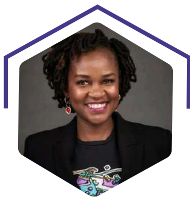
Co-Founder & Partner