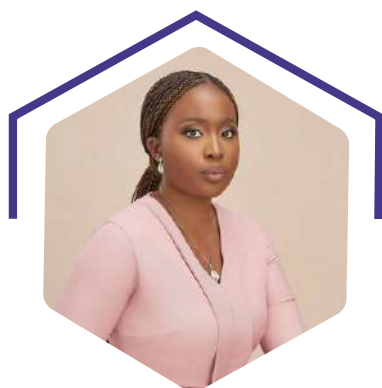
Founder and CEO