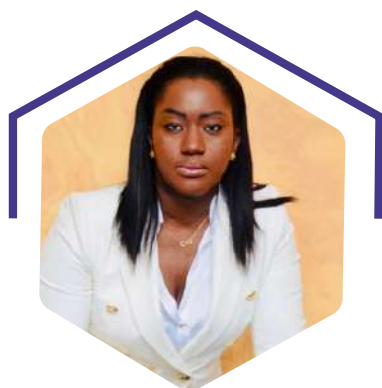
CEO & Managing Partner