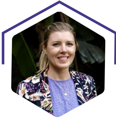
Co-Founder and CEO