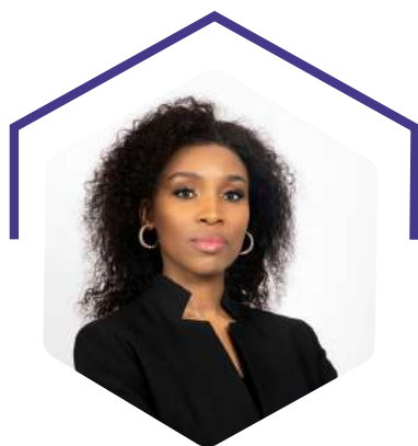
Founder & Managing Partner