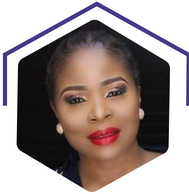
Founder and CEO