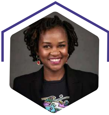
Co-Founder & Partner