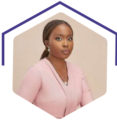
Founder and CEO