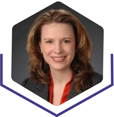
Co-Founder & Partner