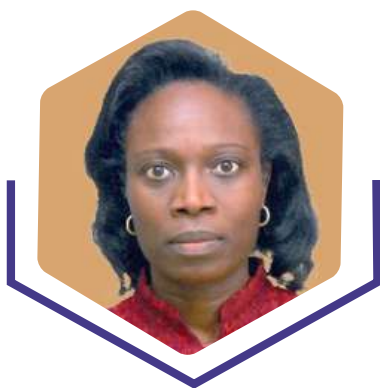
Partner and COO